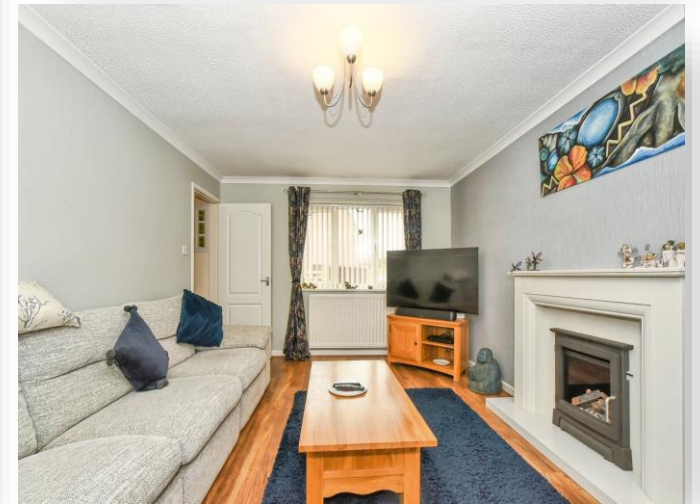
Fir Grove, Calne SN11 8JL