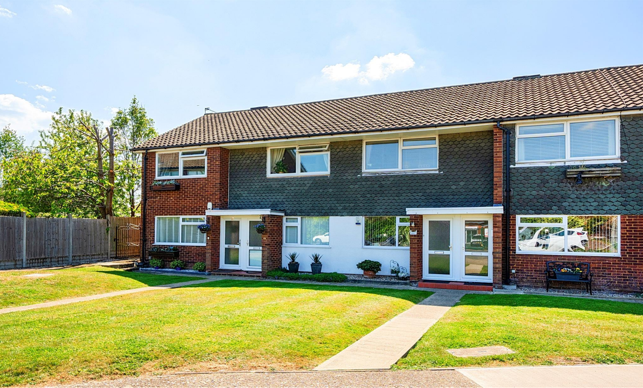
Cheviot Court, Cheviot Close, Enfield, EN1 3UY