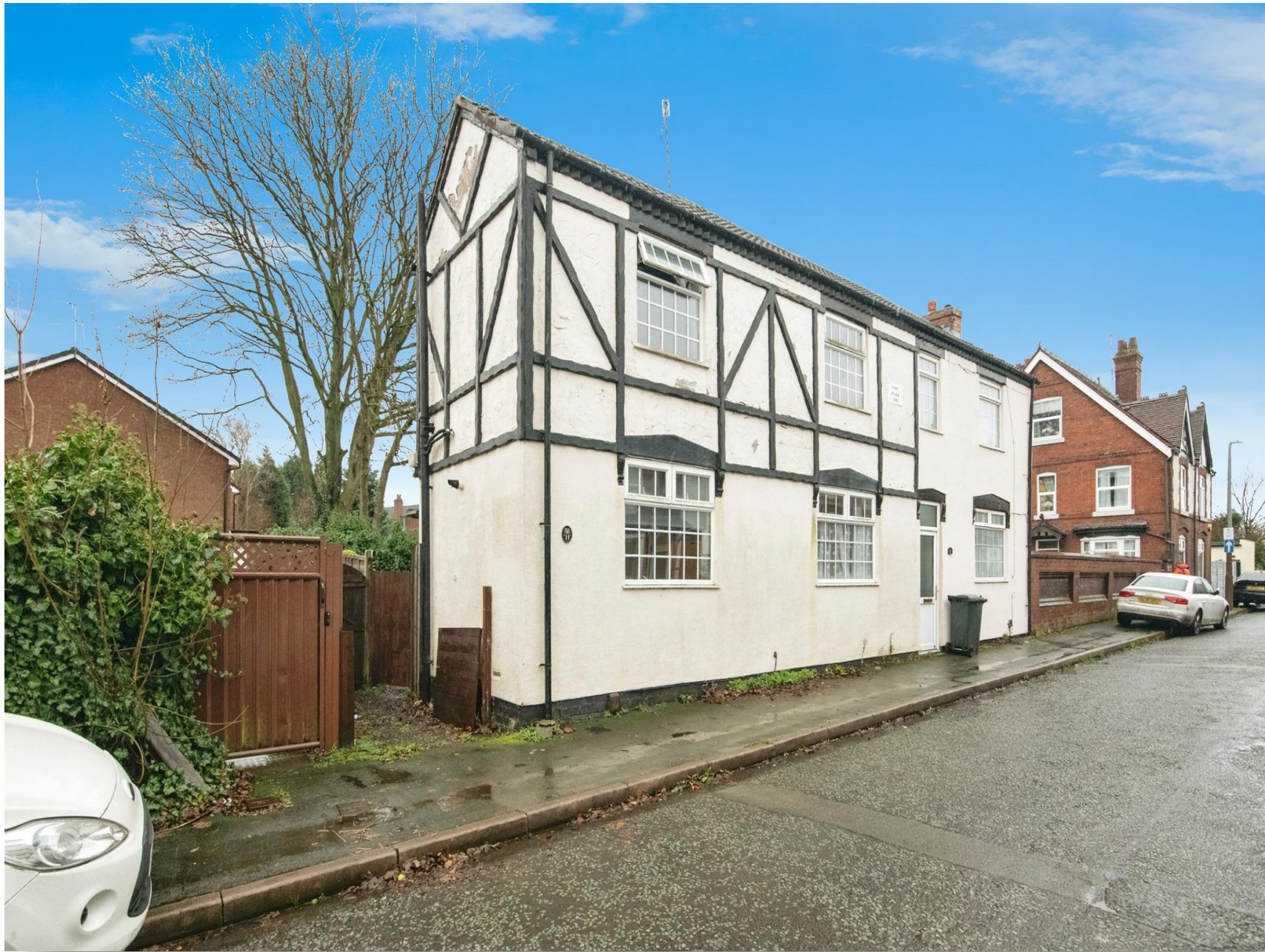
Victoria Street, Brierley Hill DY5 1RD