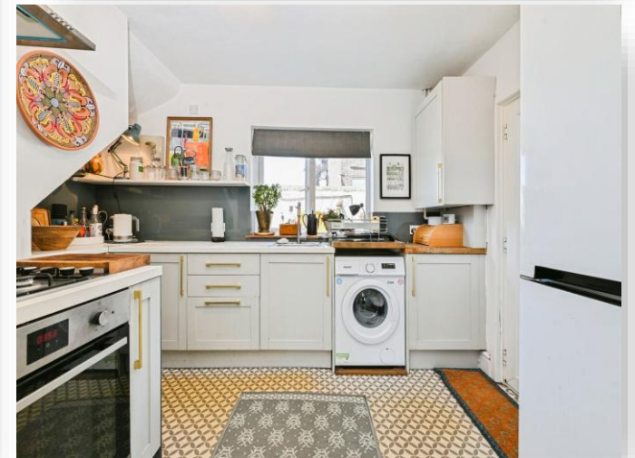
Wilford Lane, Wilford Nottingham NG11 7AX