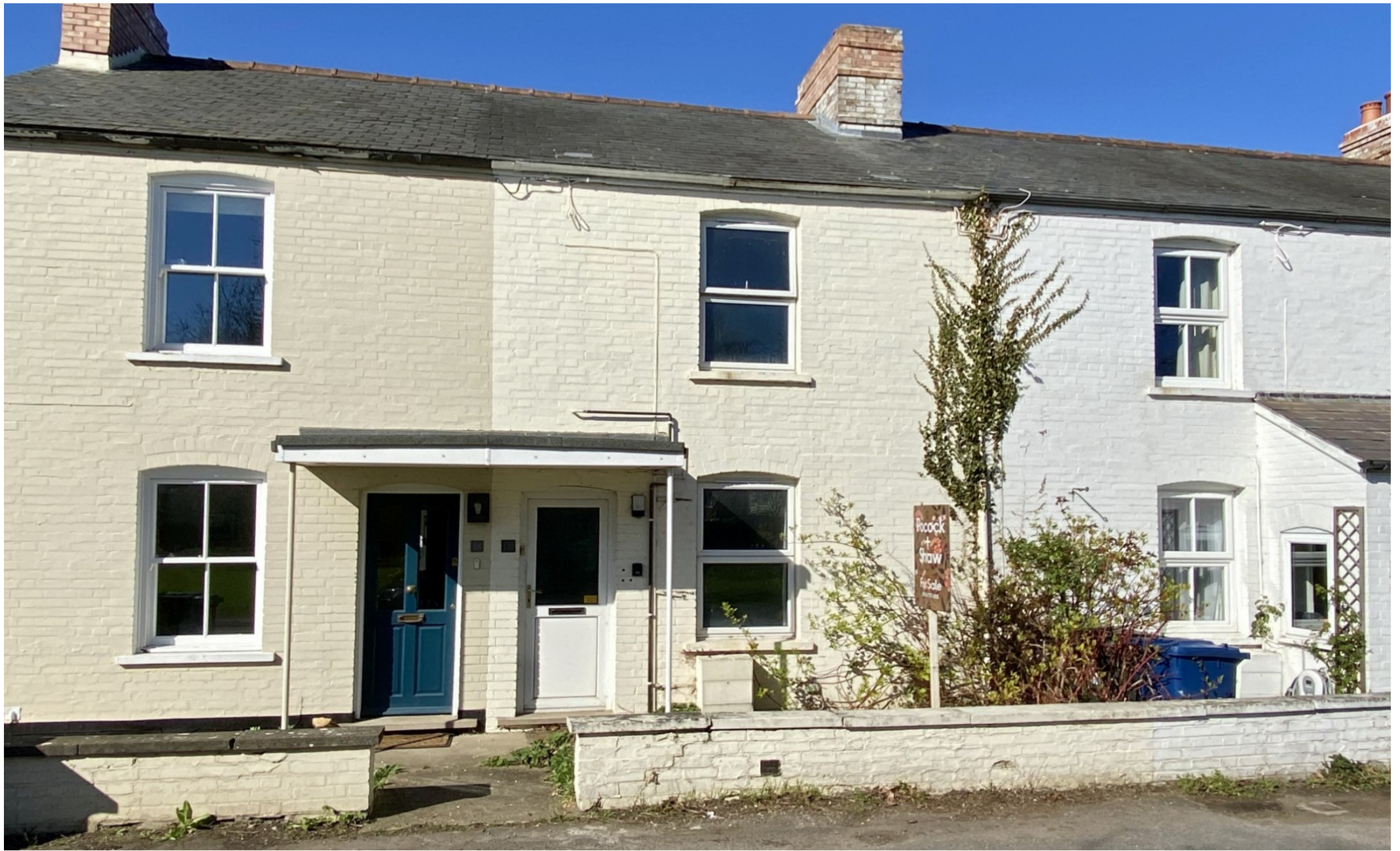
The Lane, Hauxton CB22 5HP