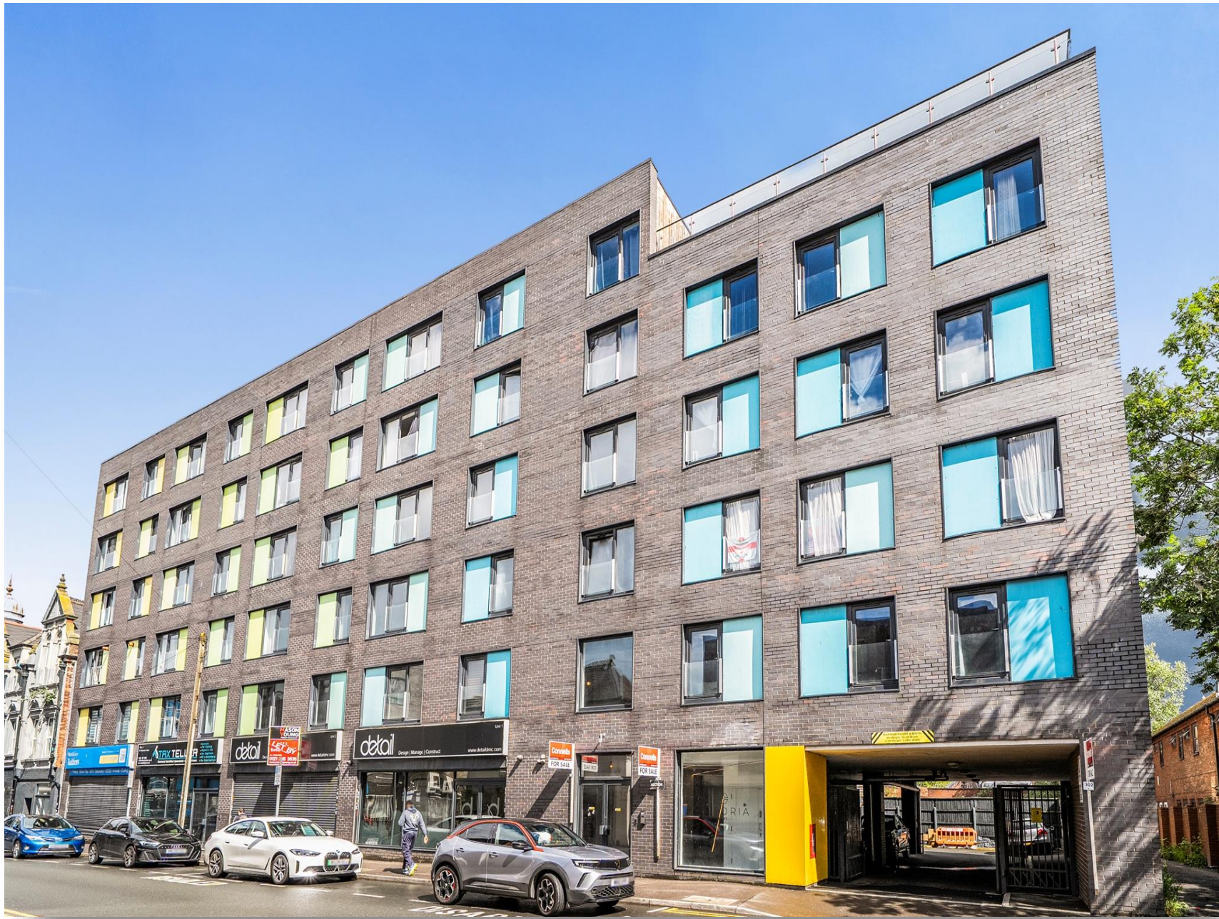
Victoria Court Victoria Street, West Bromwich B70 8BW