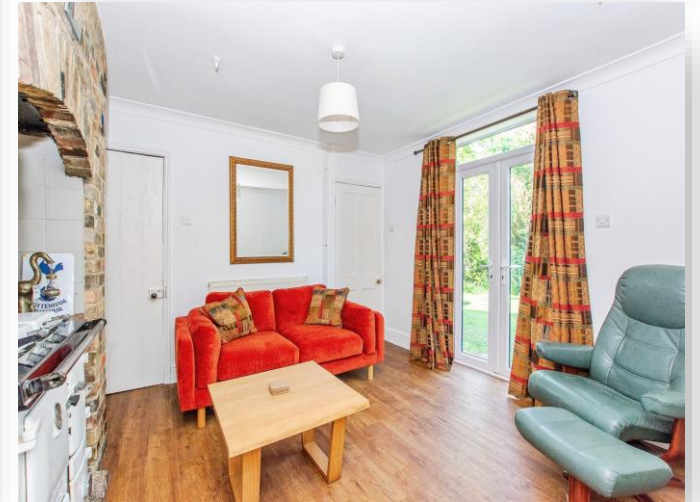
Kirkgate, Tydd St. Giles Wisbech PE13 5NE