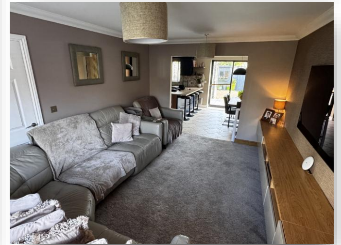
Goodrington Place, Broughton, Milton Keynes, MK10 9NT