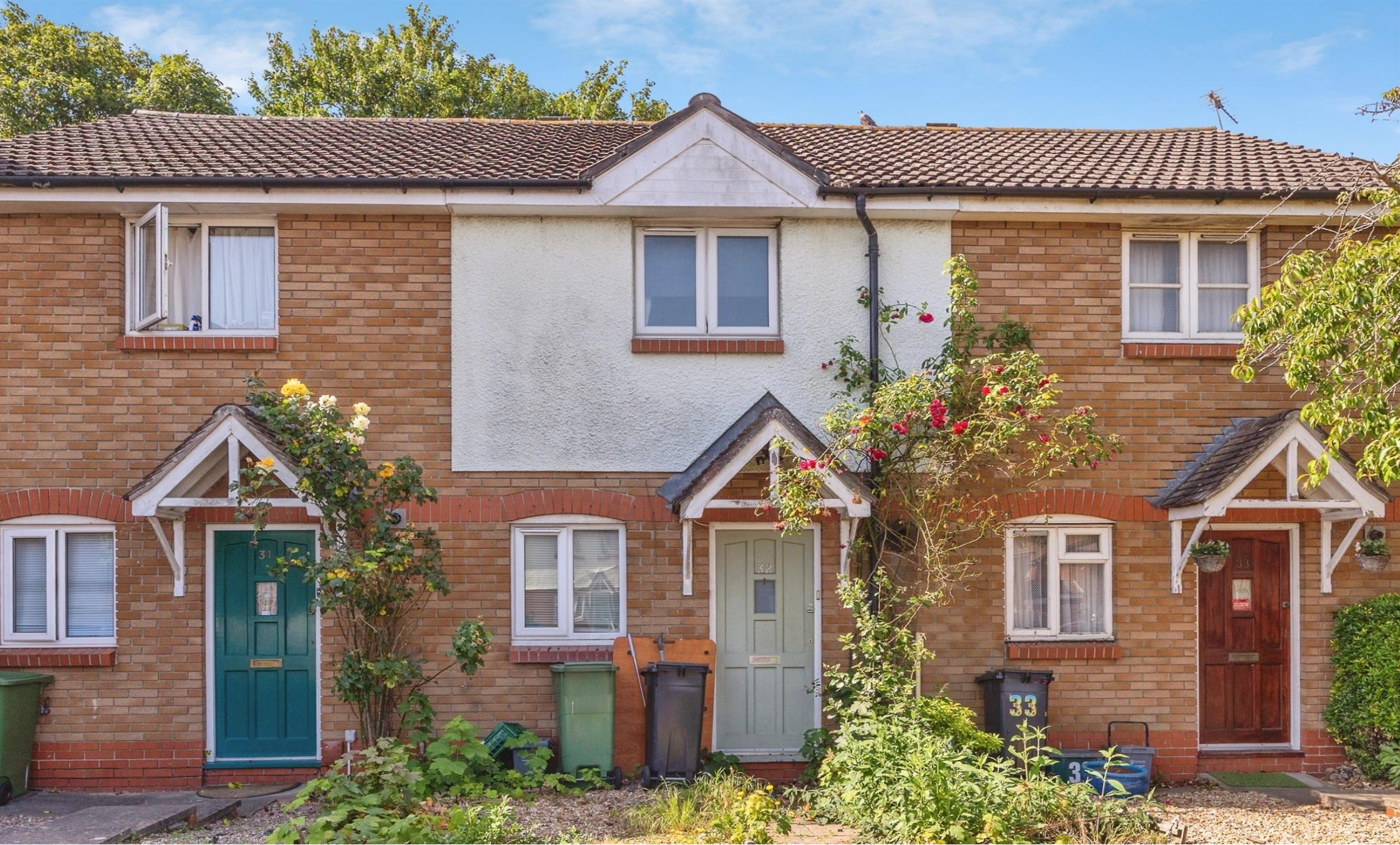
Merlin Drive, Portsmouth PO3 5QY