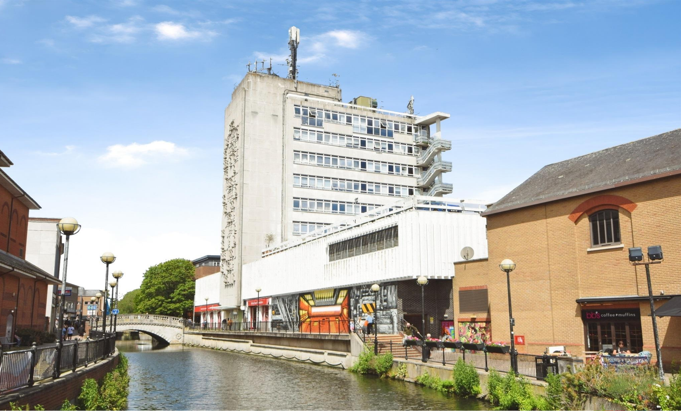
Canside, Meadow Walk, Chelmsford CM1 1FU