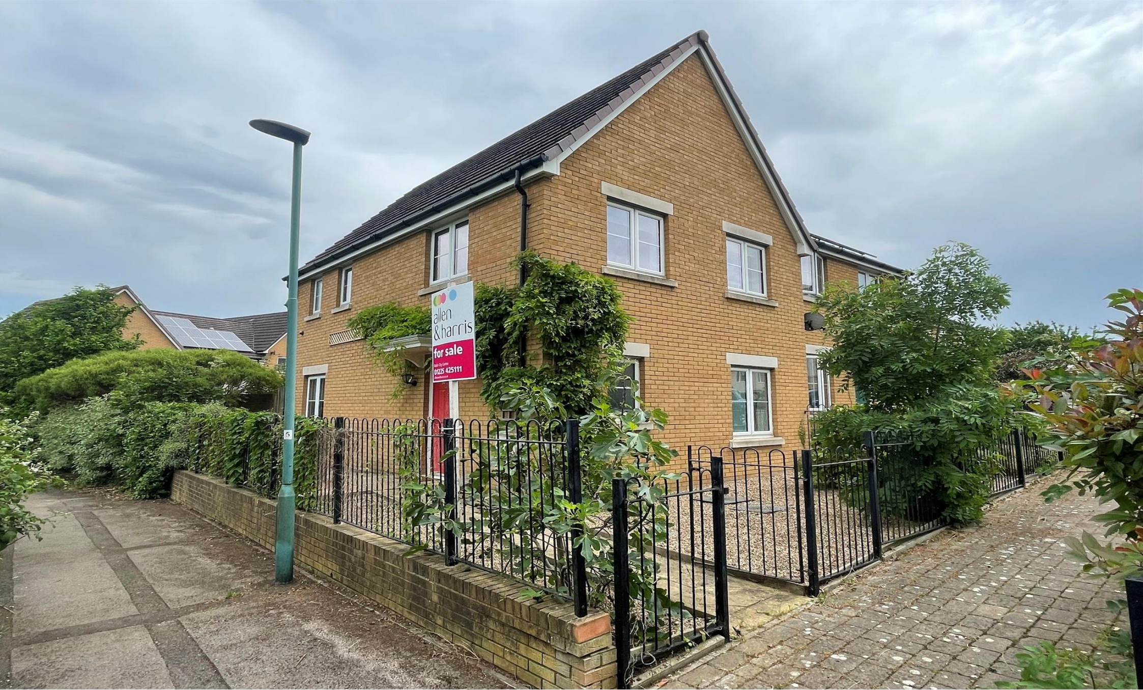
Pennyquick View, Bath BA2 1RZ