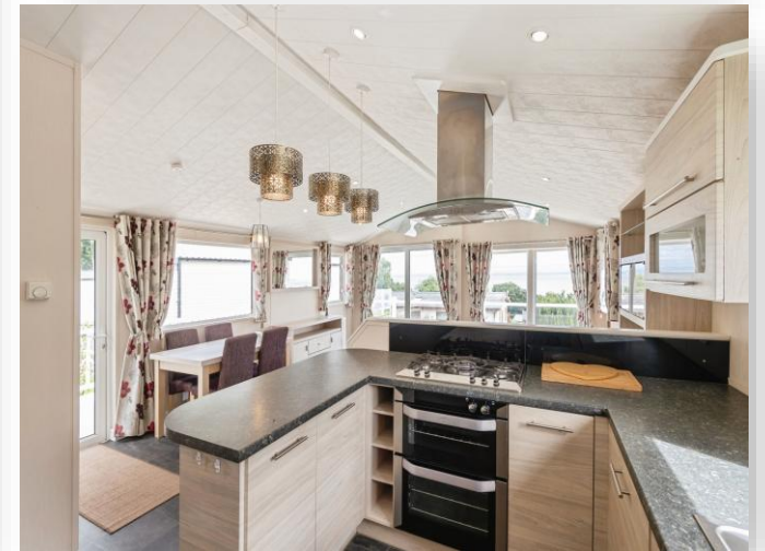
Warren Bay Holiday Village, Watchet, TA23 0JR