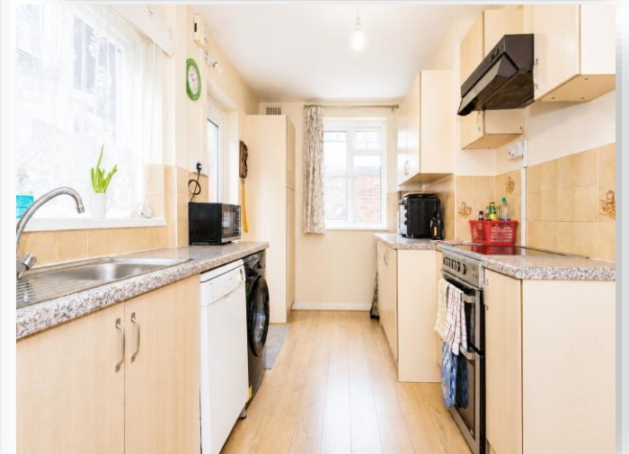
Freemantle Common Road, Southampton SO19 7BD