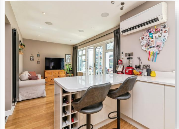
South Road, West Bridgford Nottingham NG2 7AH