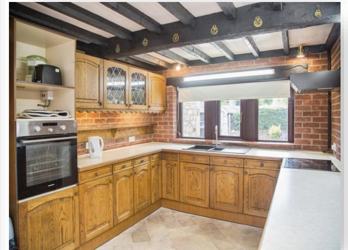
Wood Farm Lane, Brockholes Holmfirth HD9 7AP