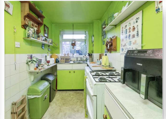
Knaves Hill, Linslade, Leighton Buzzard, LU7 2SE