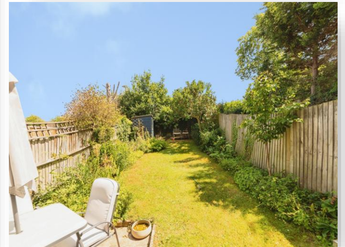
Moorymead Close, Watton At Stone, Hertford, SG14 3HF