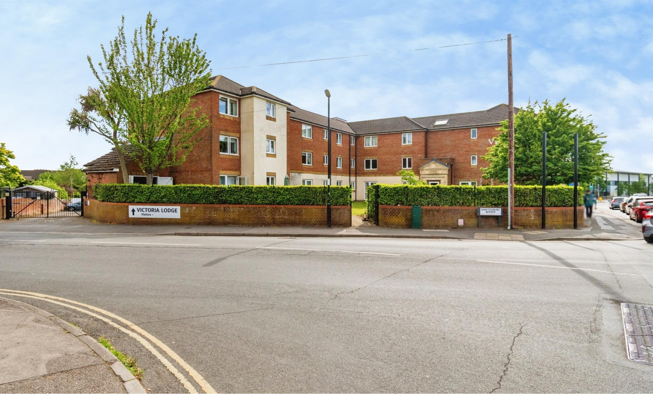
Victoria Lodge, Highfield Lane, SOUTHAMPTON SO17 1NF