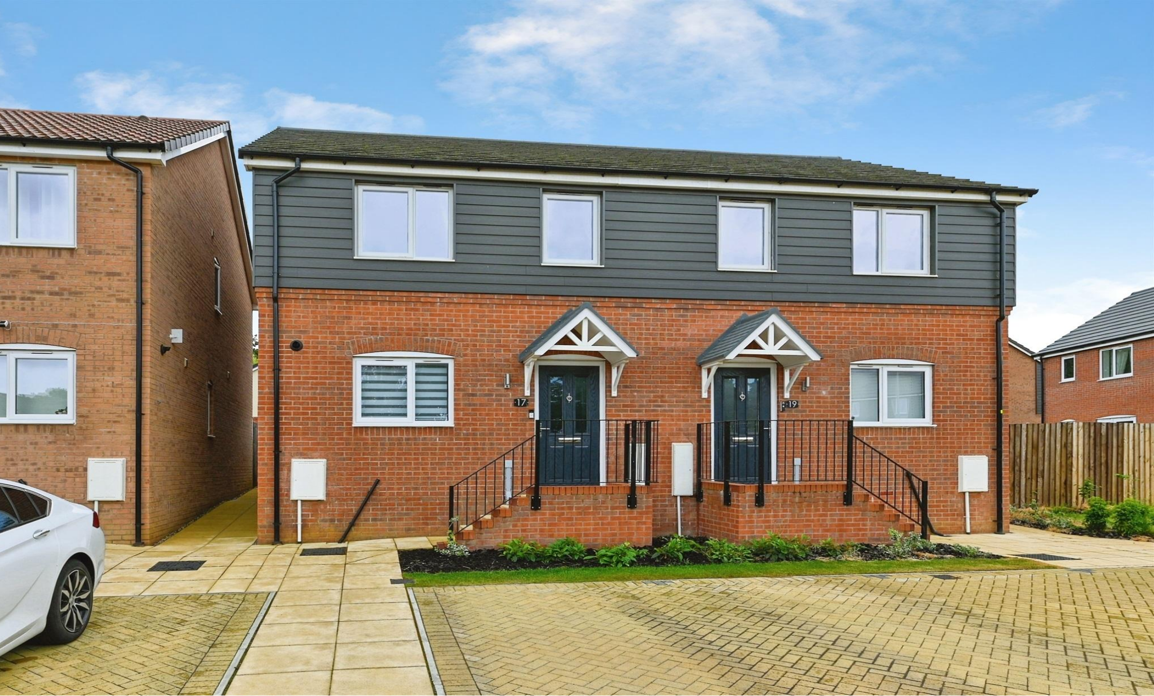
Blackthorn Drive, West Lynn, King's Lynn, PE34 3LT