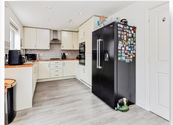
Weighbridge Way, Raunds NN9 6TT