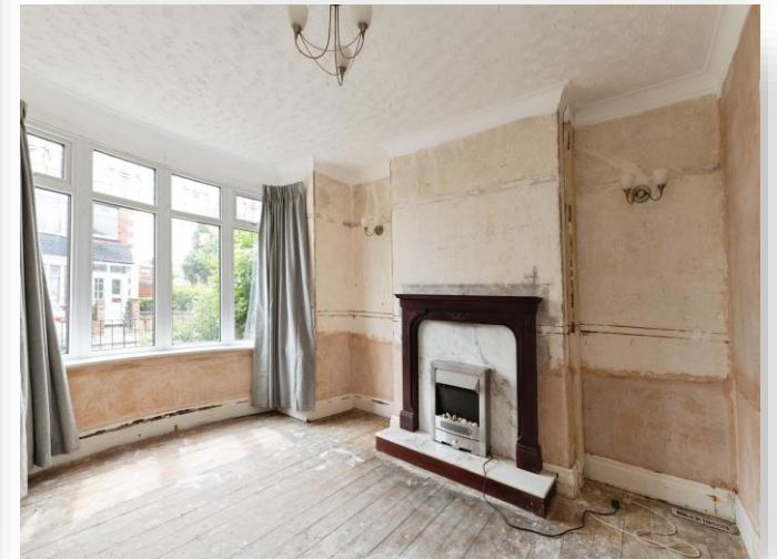
Rochester Road, Middlesbrough TS5 6QE