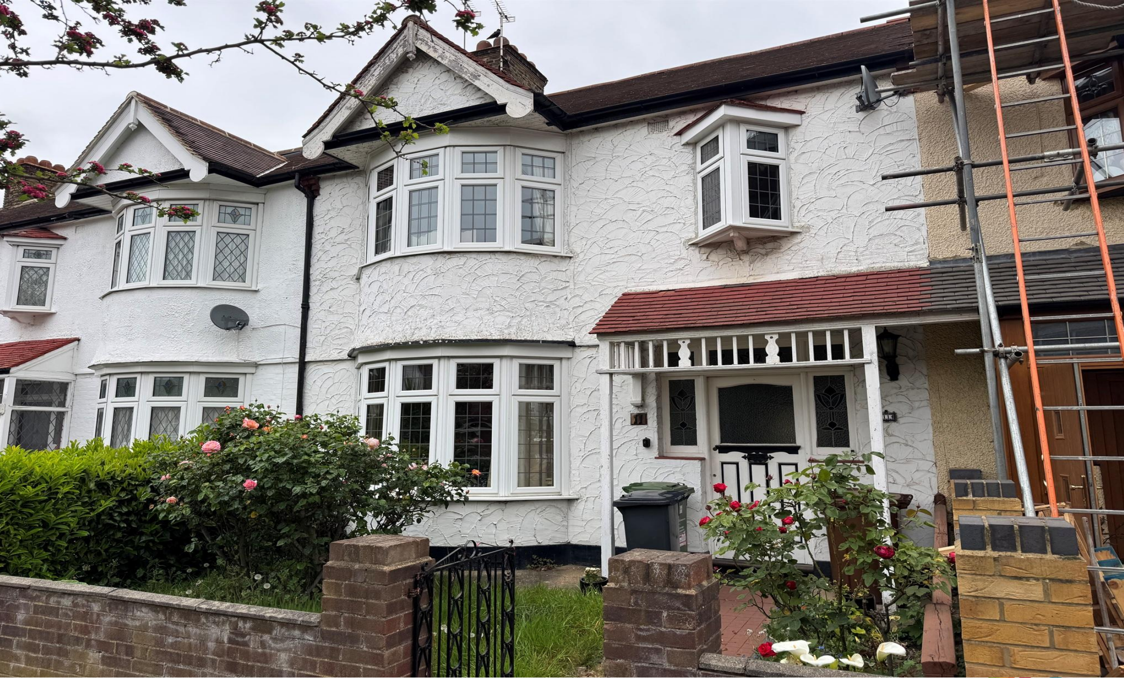
Lyndhurst Gardens, Barking, IG11 9YB