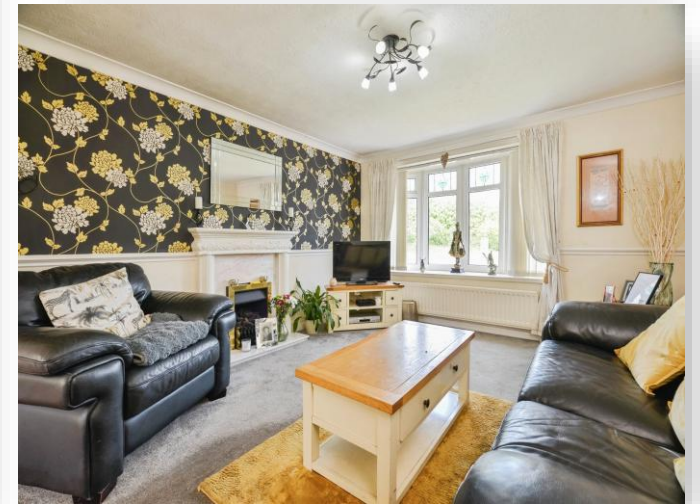
The Glebe, Stockton-On-Tees TS20 1RD