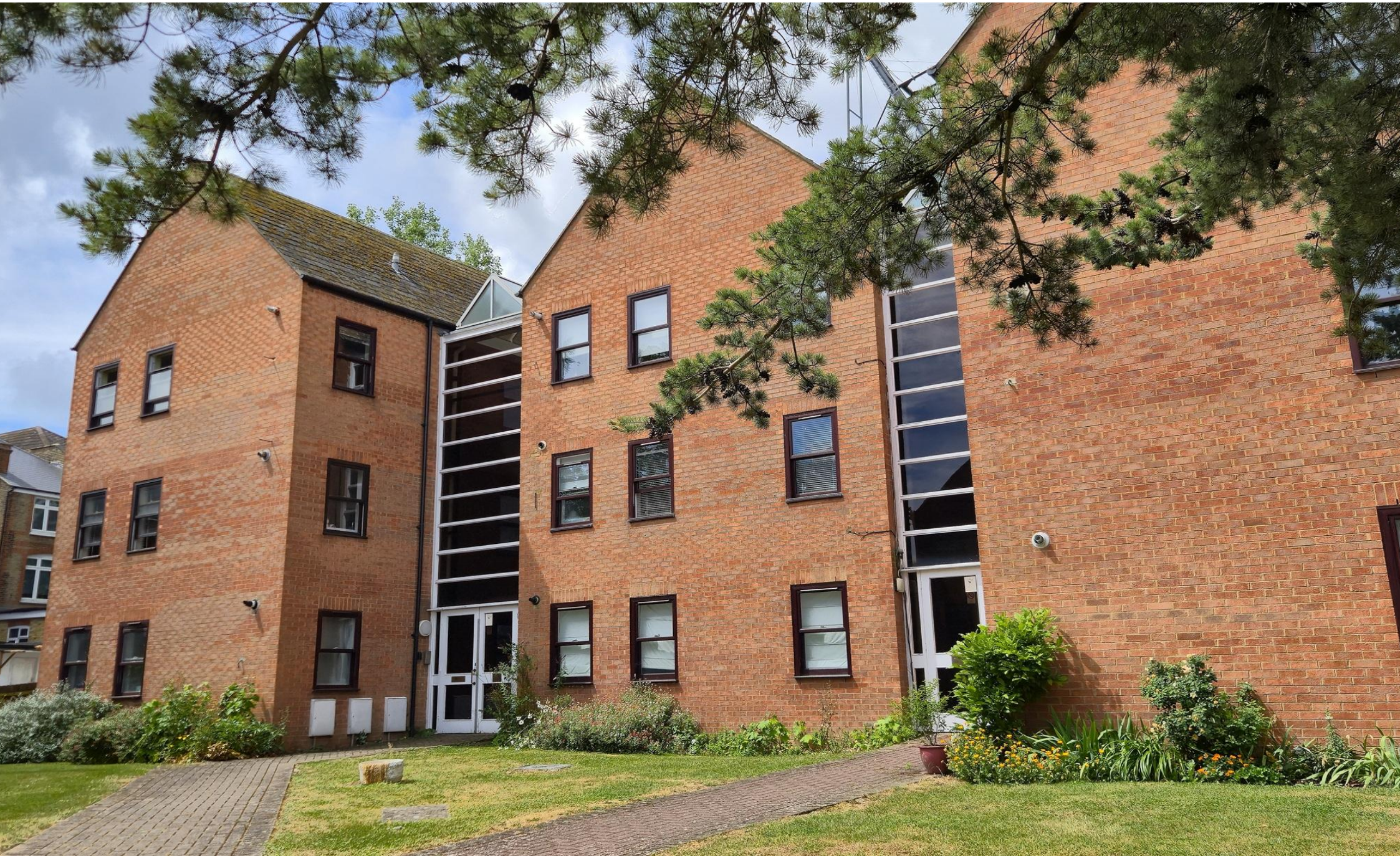
Bennets Lodge, Chase Court Gardens, Enfield, EN2 8DB