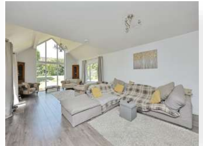
Old Orchard Pyebush Lane, Acle Norwich NR13 3QZ