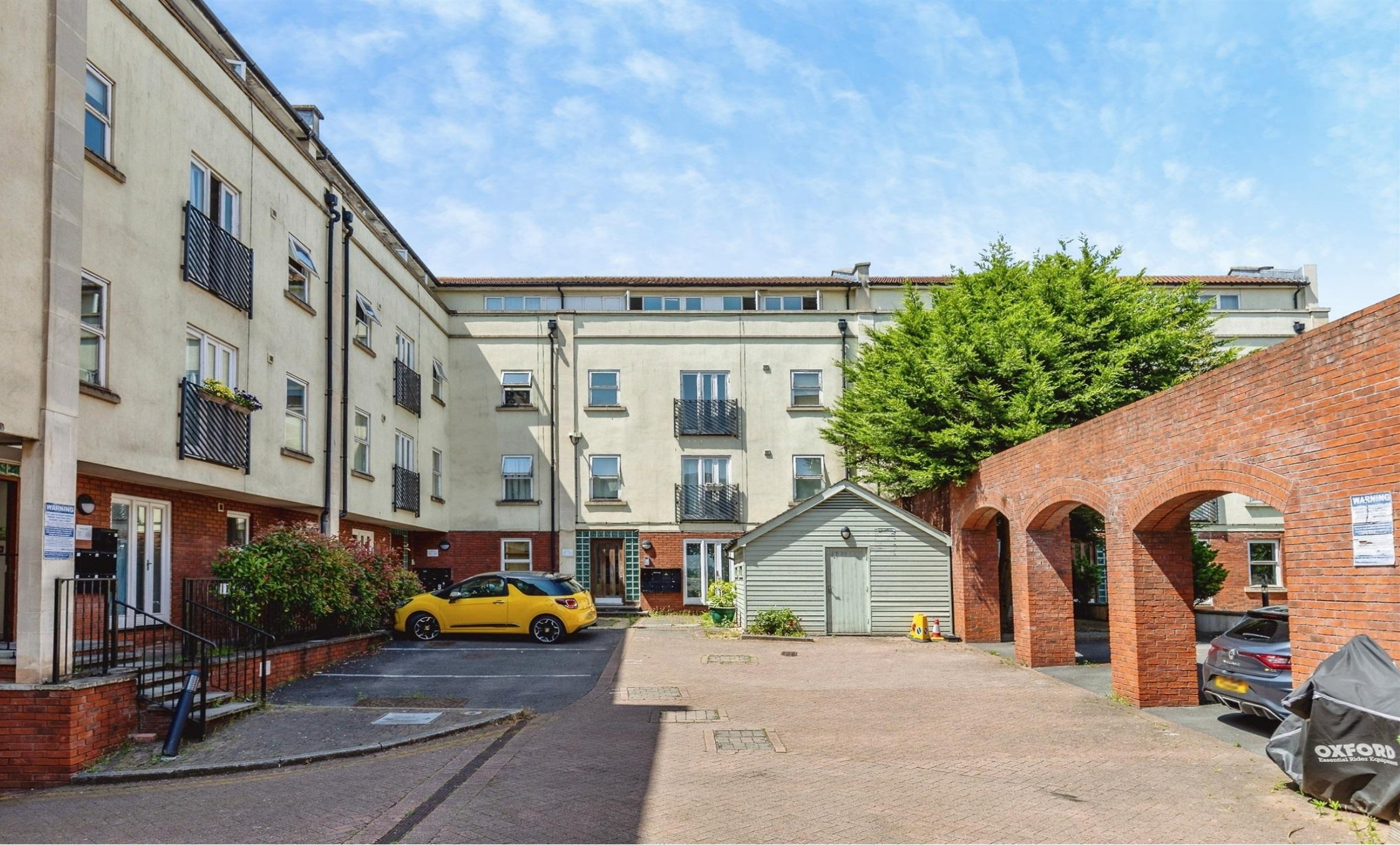
Midland Mews Waterloo Road, Old Market Bristol BS2 0PL