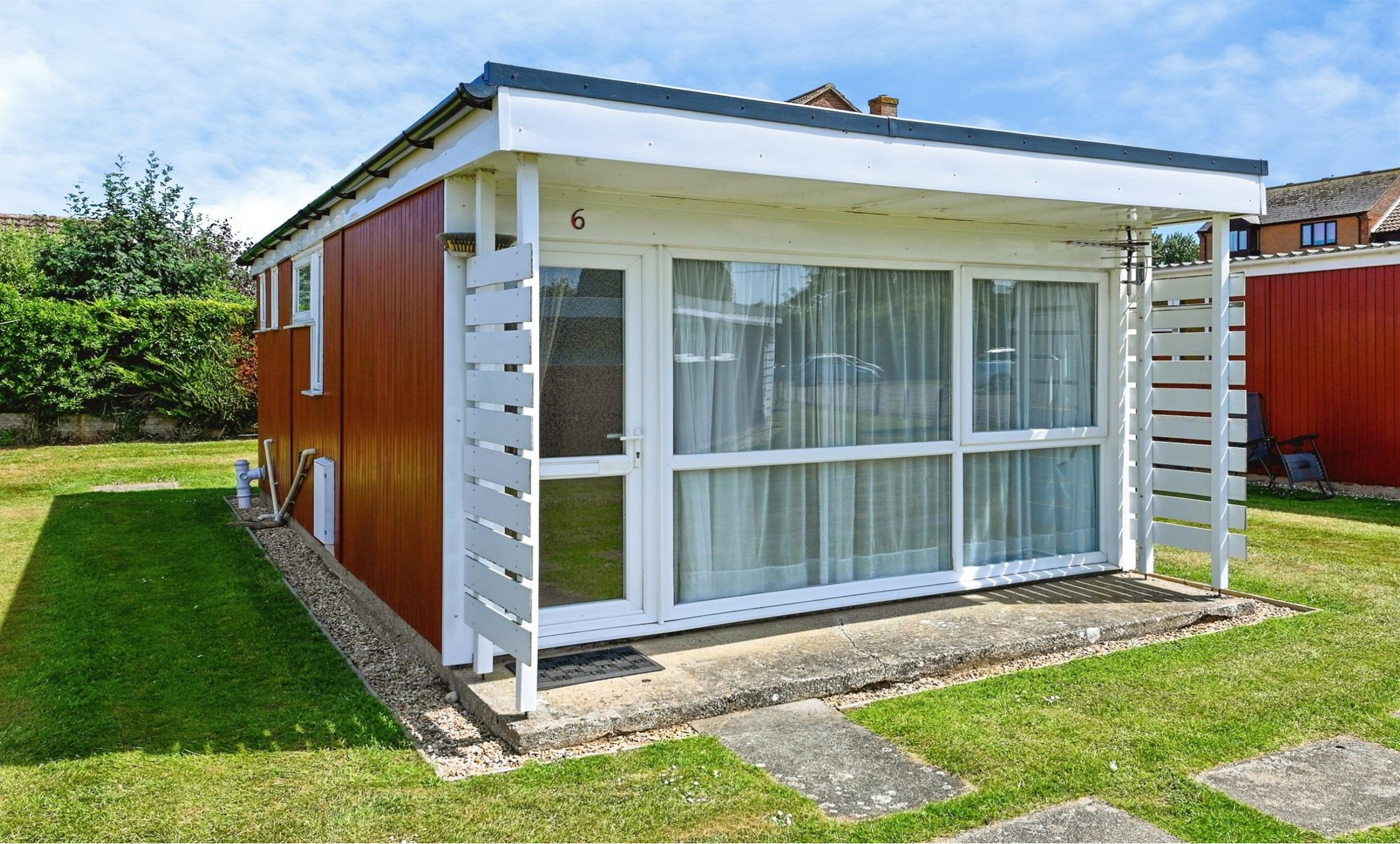
Cedar Springs, Bankside, Heacham, King's Lynn, PE31 7AU