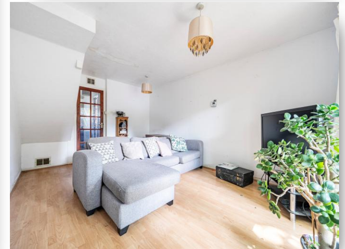
20 Stonefield Park, Maidenhead SL6 6ES