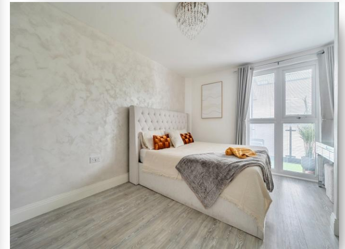
Apartment 22 Exclusive House, Oldfield Road, Maidenhead SL6 1NQ