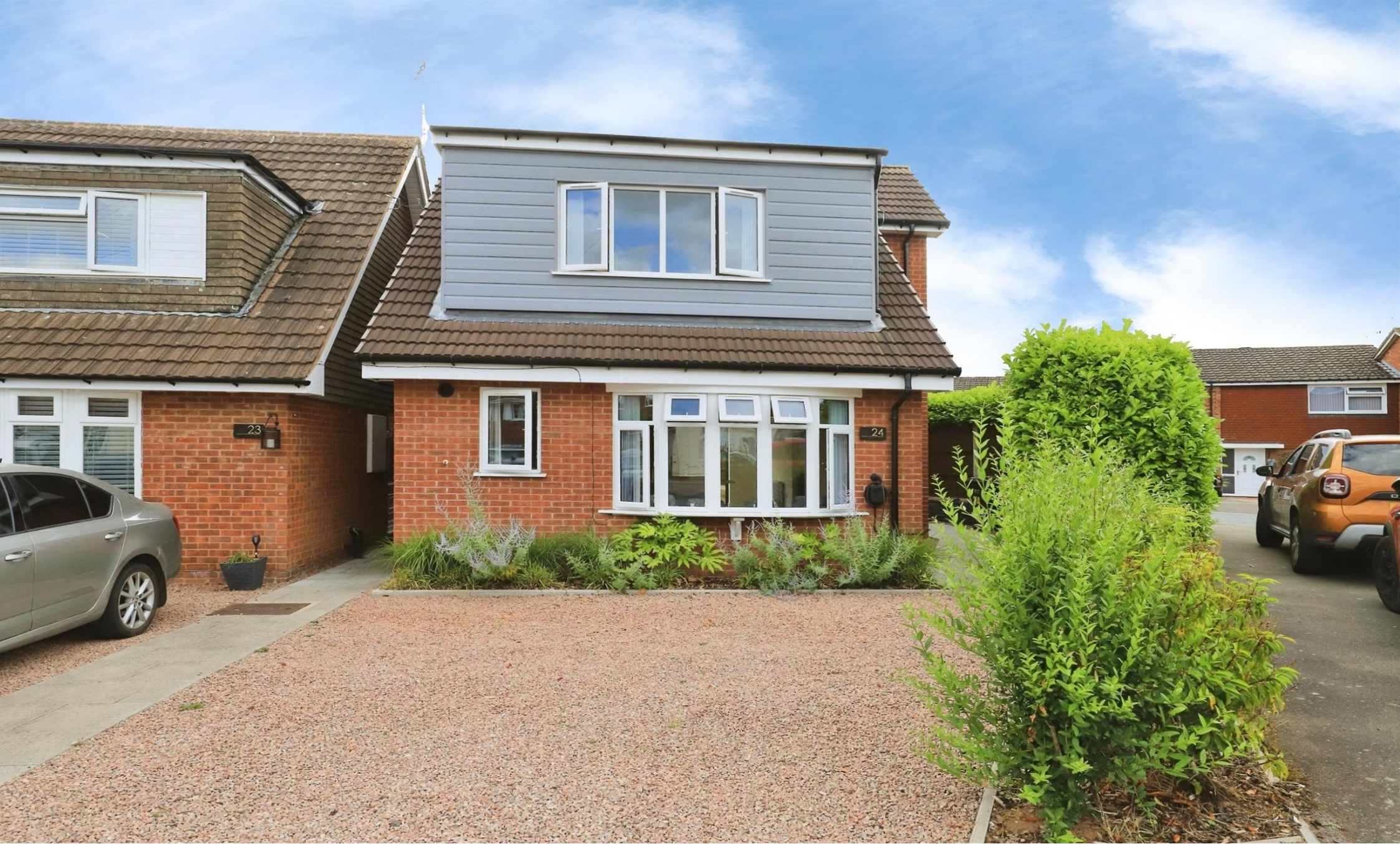
Silver Birch Drive, Kidderminster DY10 3XD