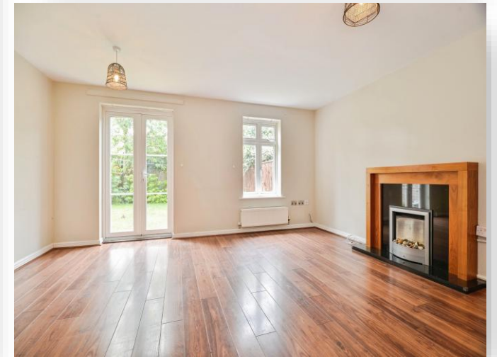
Barberry, Coulby Newham Middlesbrough TS8 0WB