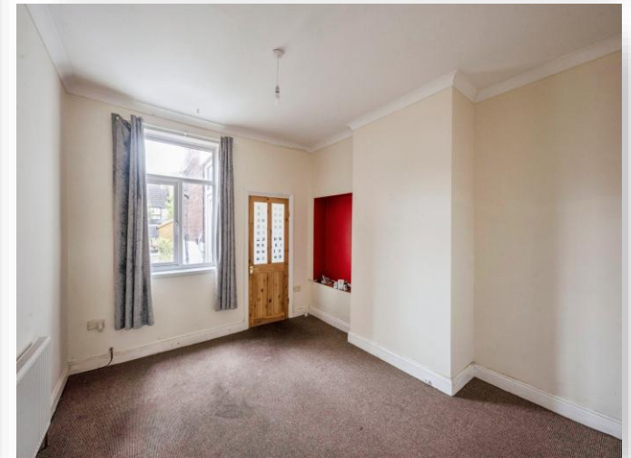
Crown Street, Swinton MEXBOROUGH S64 8NB