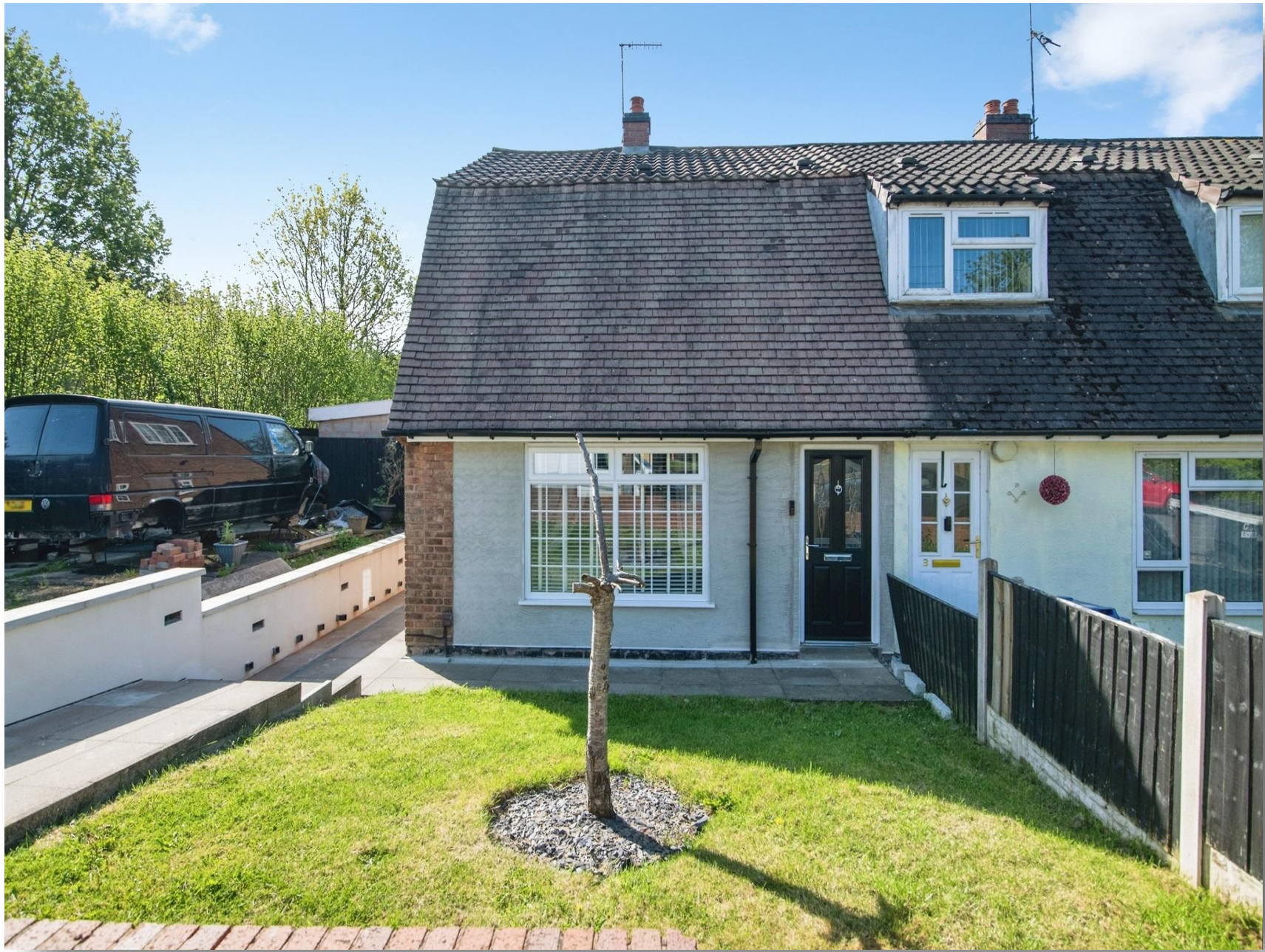
Banklands Road, Dixons Green Dudley DY2 8BT