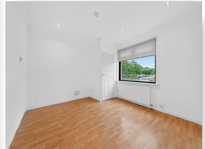
Bogleshole Road, Cambuslang Glasgow G72 7DD