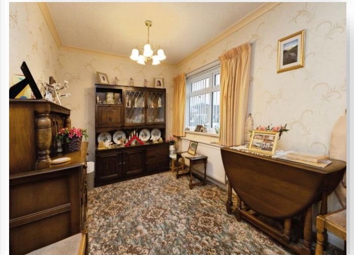
Boston Drive, Marton-In-Cleveland Middlesbrough TS7 8LZ