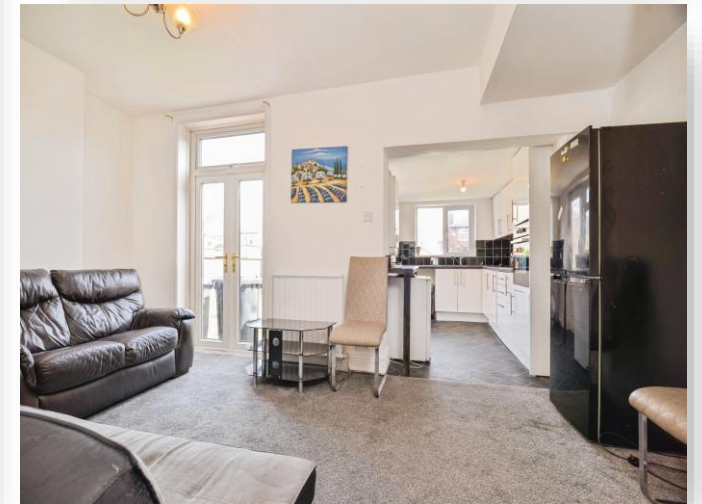
Downside Road, Middlesbrough TS5 4QT