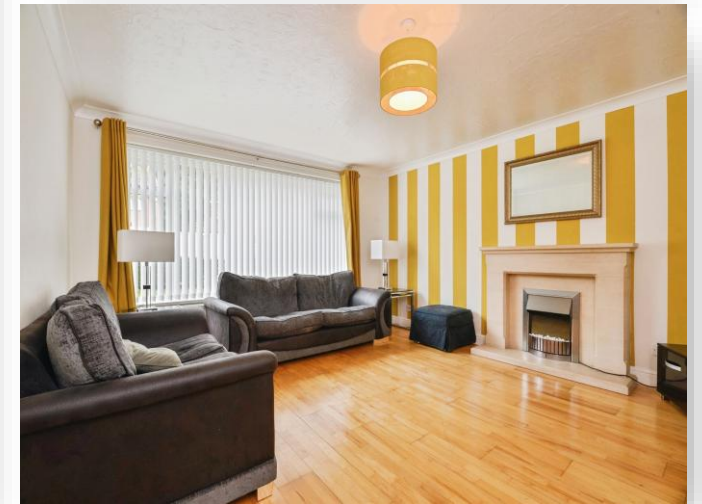
Campion Grove, Marton-In-Cleveland Middlesbrough TS7 8SL