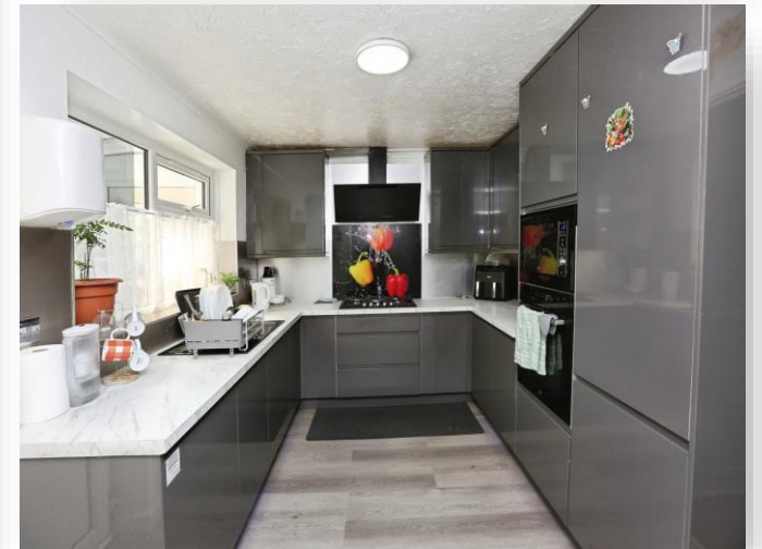
St. Anns Crescent, Gosport PO12 3JJ