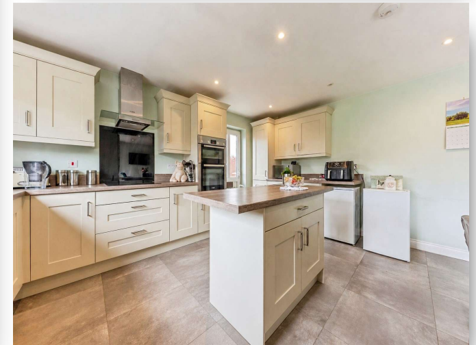
Randall Close, Newark NG24 2LF