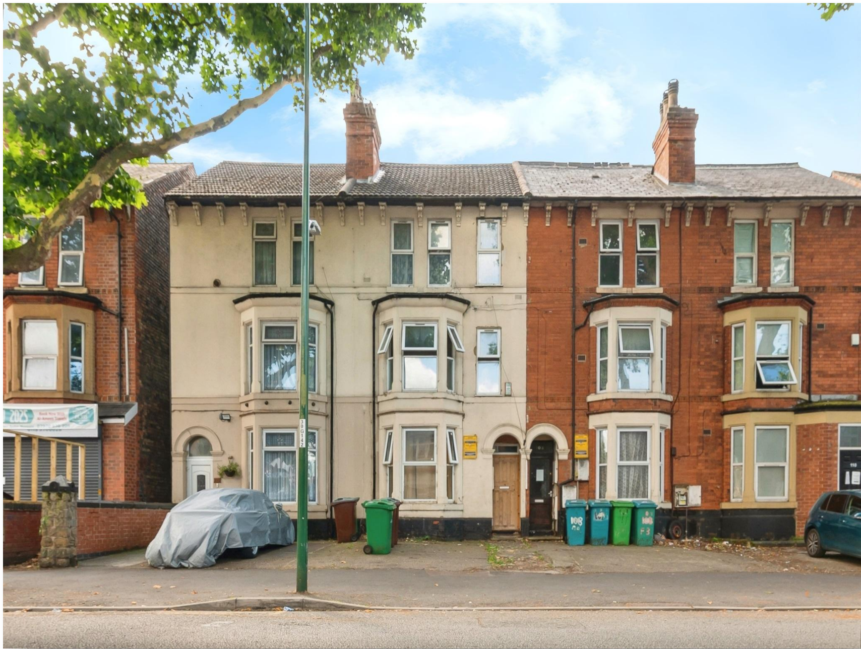
Gregory Boulevard, Nottingham NG7 5JE