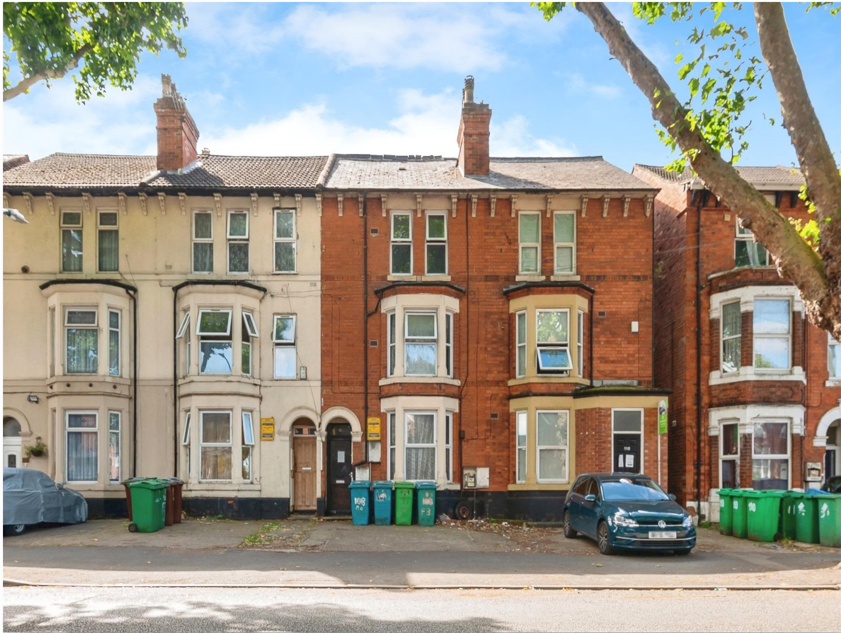
Gregory Boulevard, Nottingham NG7 5JE