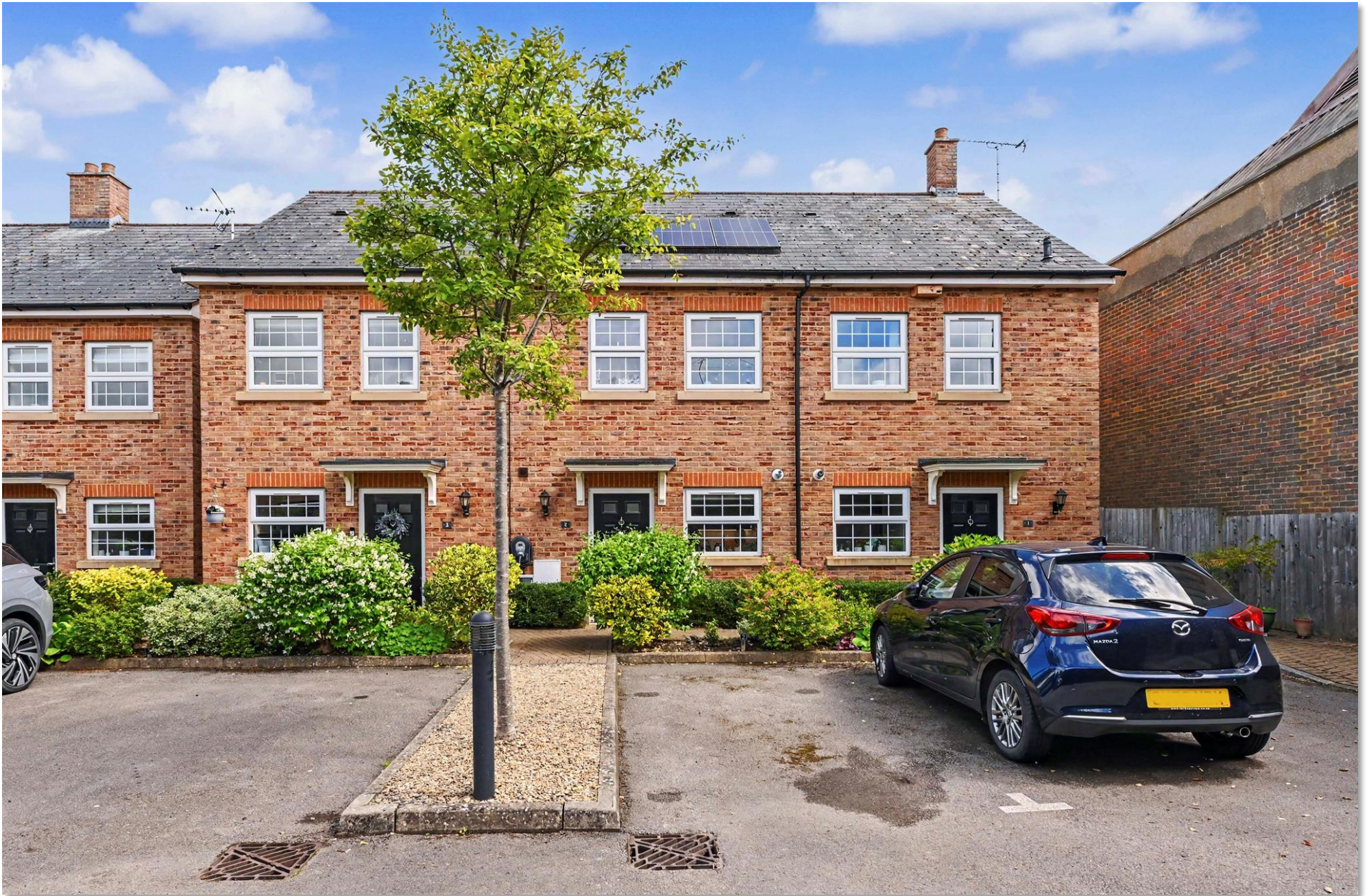
Jubilee Gardens, Tring HP23 4JG