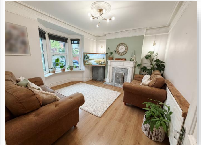
Colvile Road, Wisbech, PE13 2EL