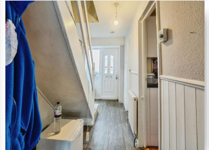
Barnes Road, Skegness PE25 2PR