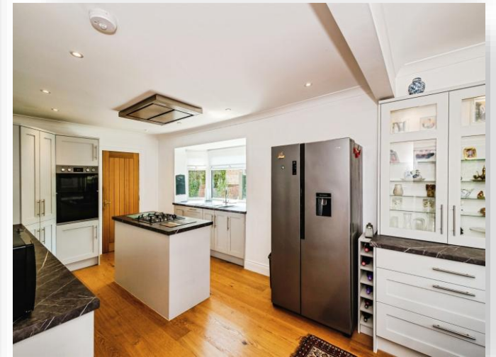
Widewater Close, LANCING BN15 8LA