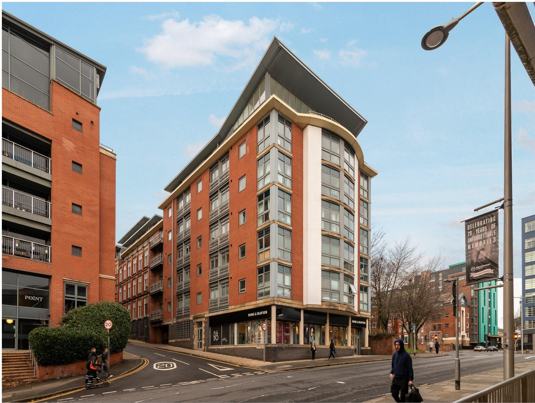
Lexington Place Plumtre Street, Nottingham NG1 1AN