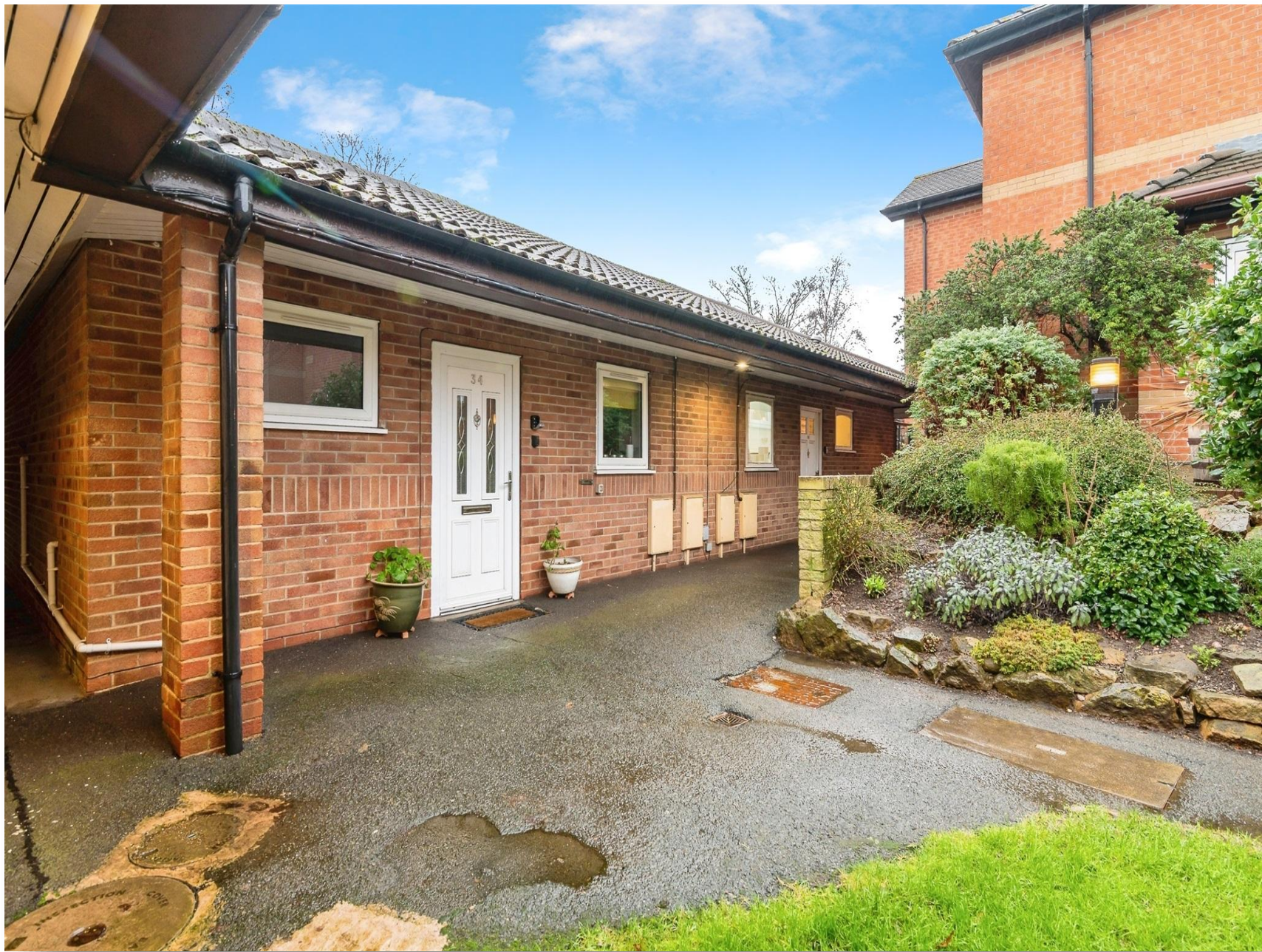
Birch Walk, The Firs Nottingham NG5 3BD