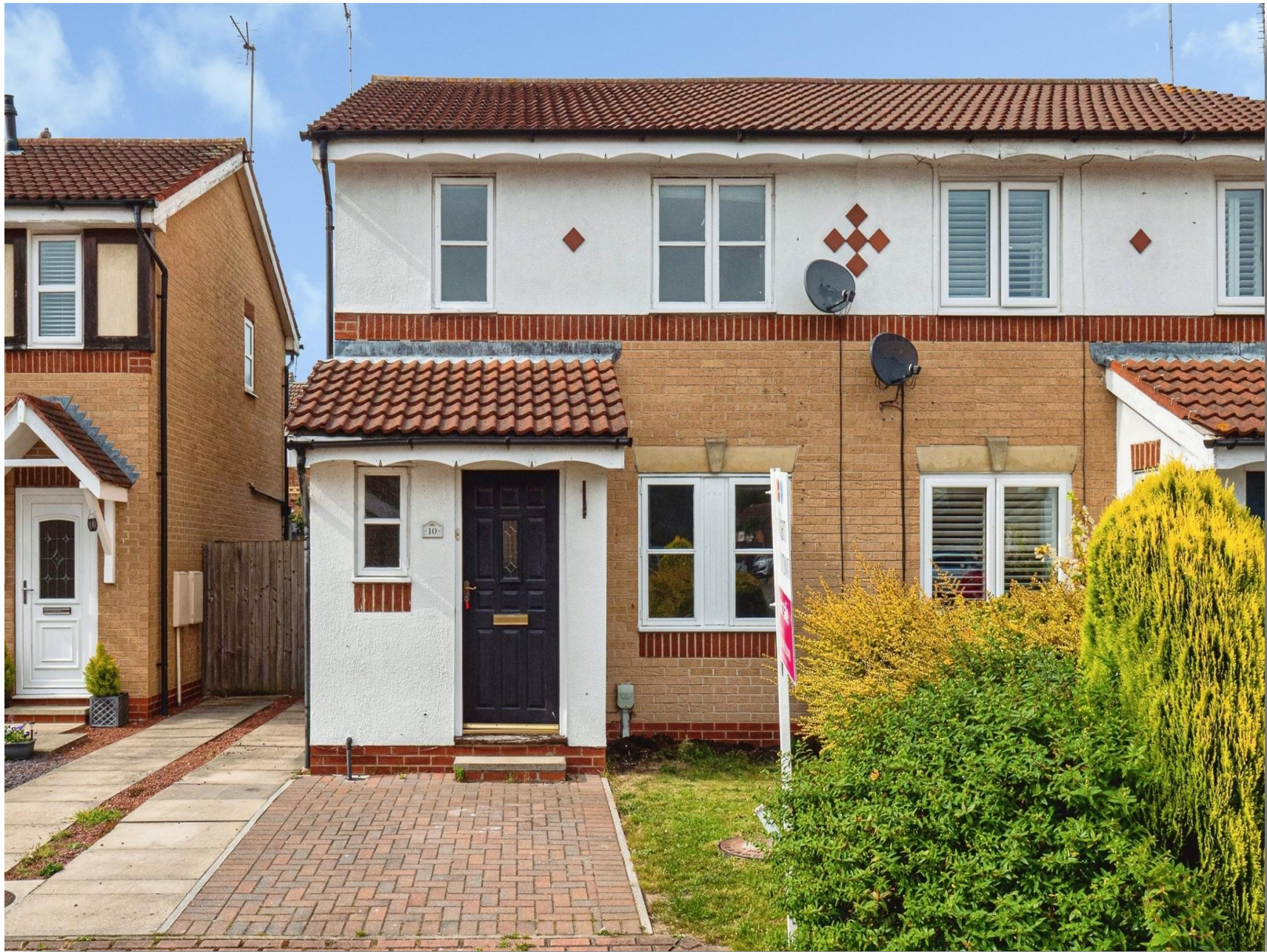
Tattersall Drive, Beverley, HU17 0NE