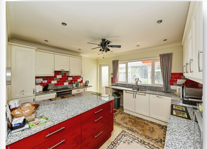
Evans Gardens, Hunstanton, PE36 5DX