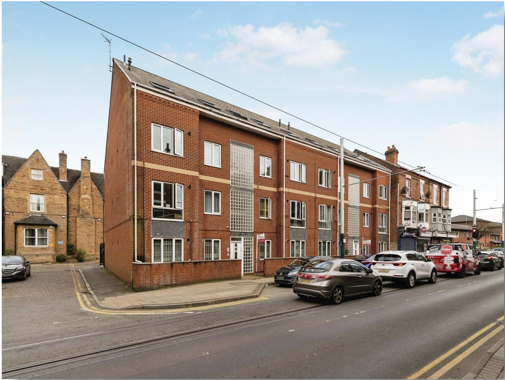
Radford Road, Nottingham NG7 5GN